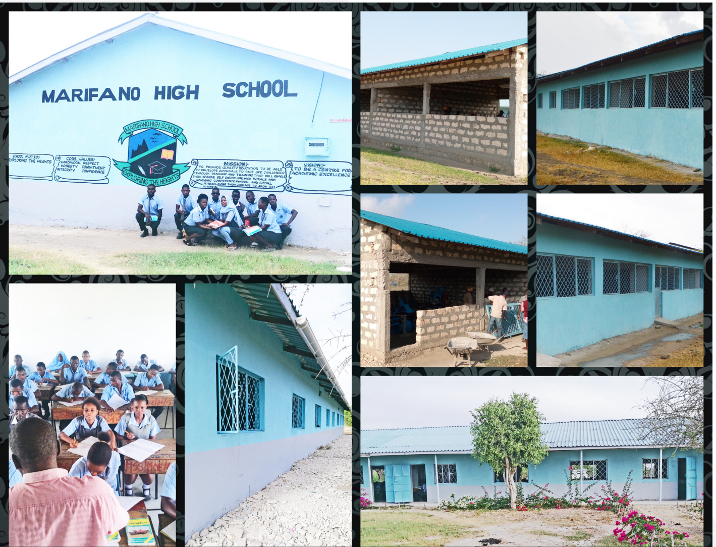
A four classroom block at Marifano Secondary School was completed with funding from the Pavillion Foundation, Singapore.