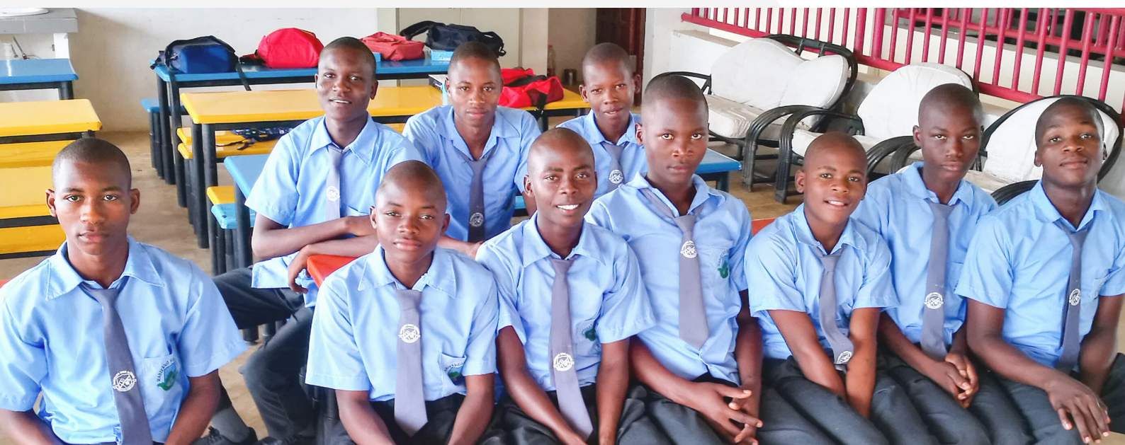
Students on TRLF sponsorship come from all over the Tana Delta, from all tribes and religious beliefs. They are chosen based on need and desire for integral development.