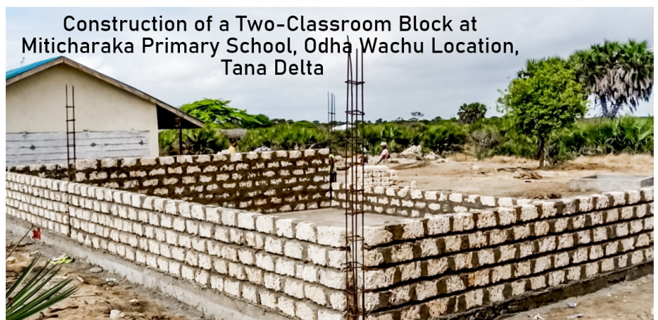
Construction of a Two-Classroom Block at Miticharaka Primary School, Odha Wachu Location, Tana Delta