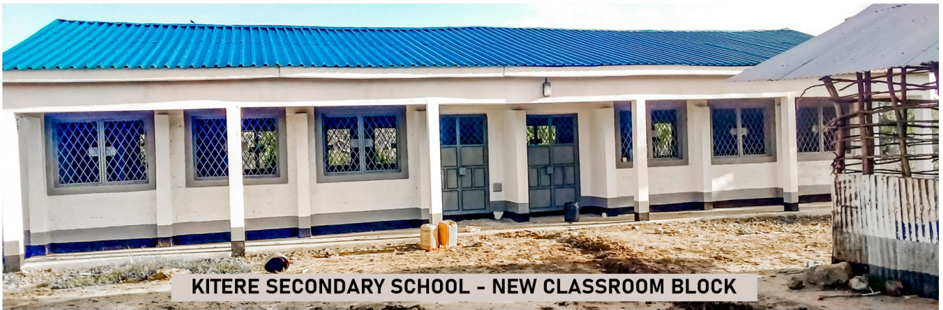
KITERE SECONDARY SCHOOL - NEW CLASSROOM BLOCK