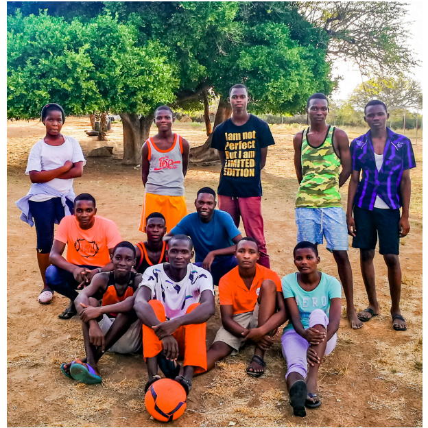
Students on the enhanced programme are nurtured holistically, to help them mature and progress not only academically, but also in their outlooks and depth of living.