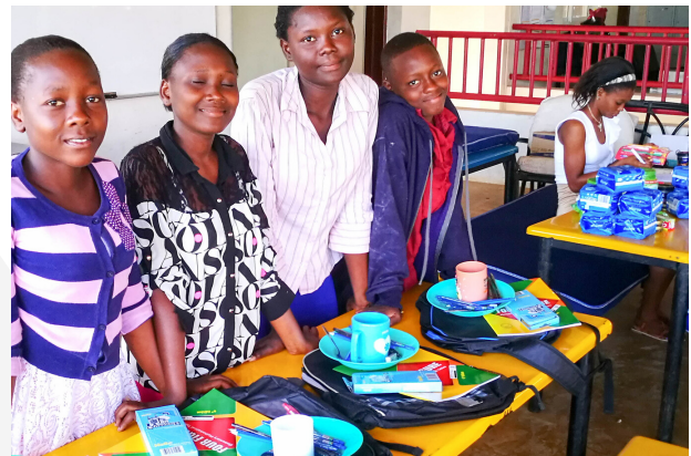
TRLF gives equal educational opportunity to the girl child, who, in poorer rural communities, are often disadvantaged.