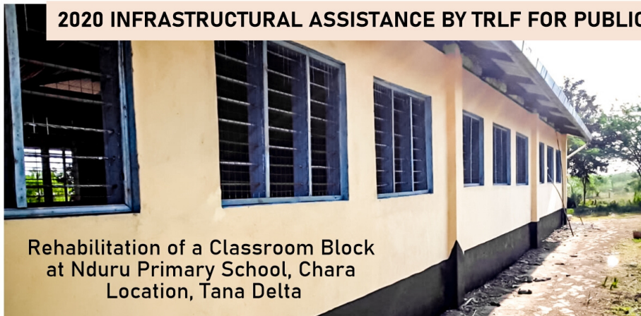
Rehabilitation of a Classroom Block at Nduru Primary School, Chara Location, Tana Delta