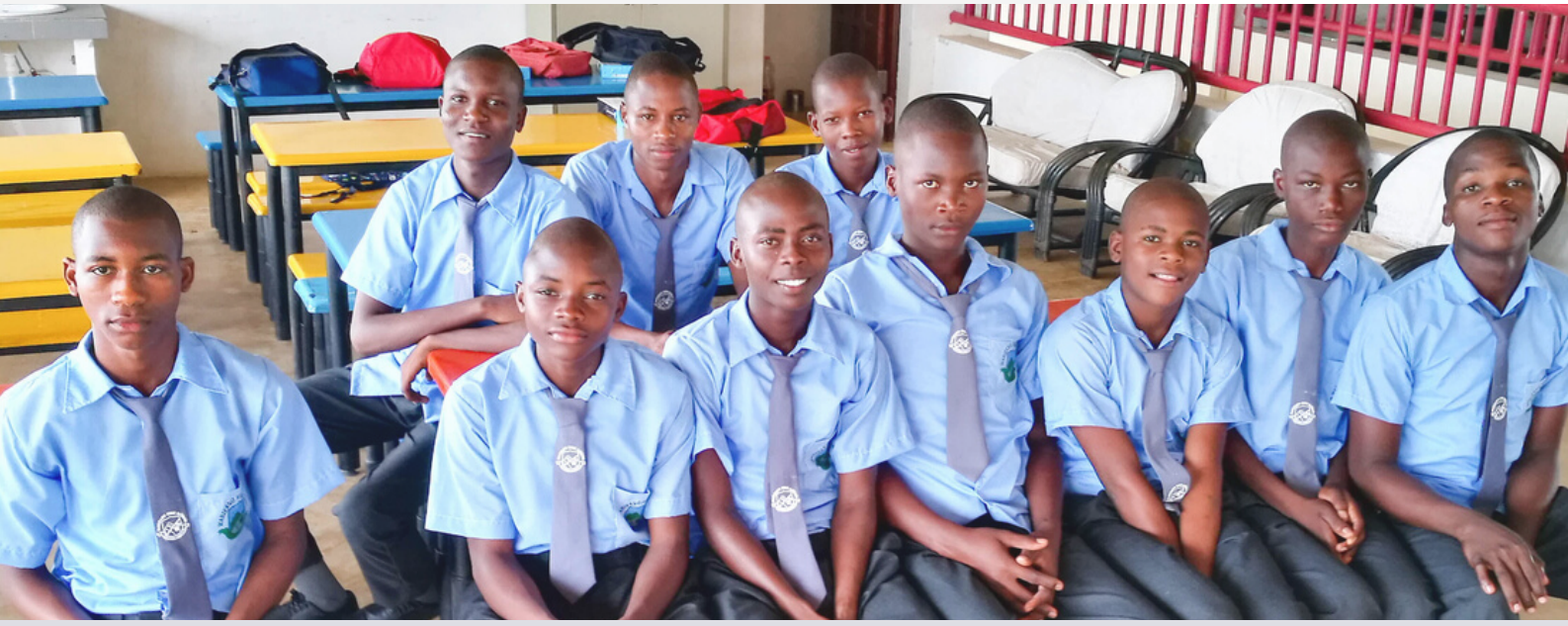
Students on TRLF sponsorship come from all over the Tana Delta, from all tribes and religious beliefs. They are chosen based on need and desire for integral development.