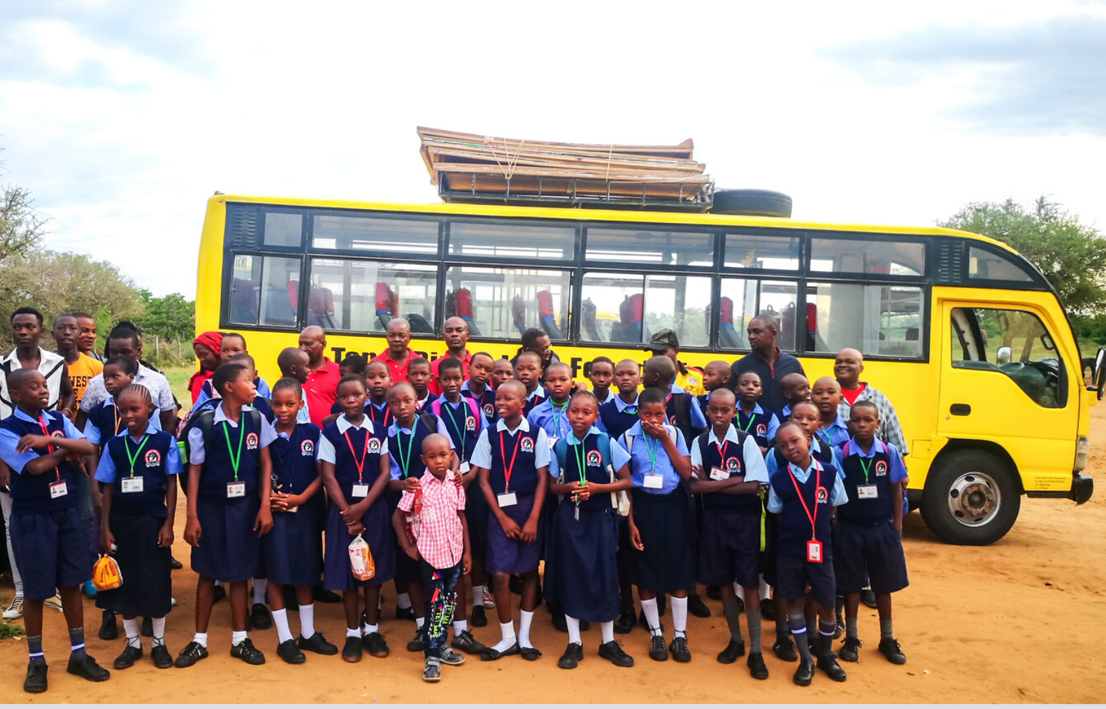
DEMSA students all ready to leave for the 2019 Inter-Schools Regional Drama Festival held in Mombasa. For many of the children it was their first time to travel outside Tana River county, and thus the first time for them to see the Indian Ocean.