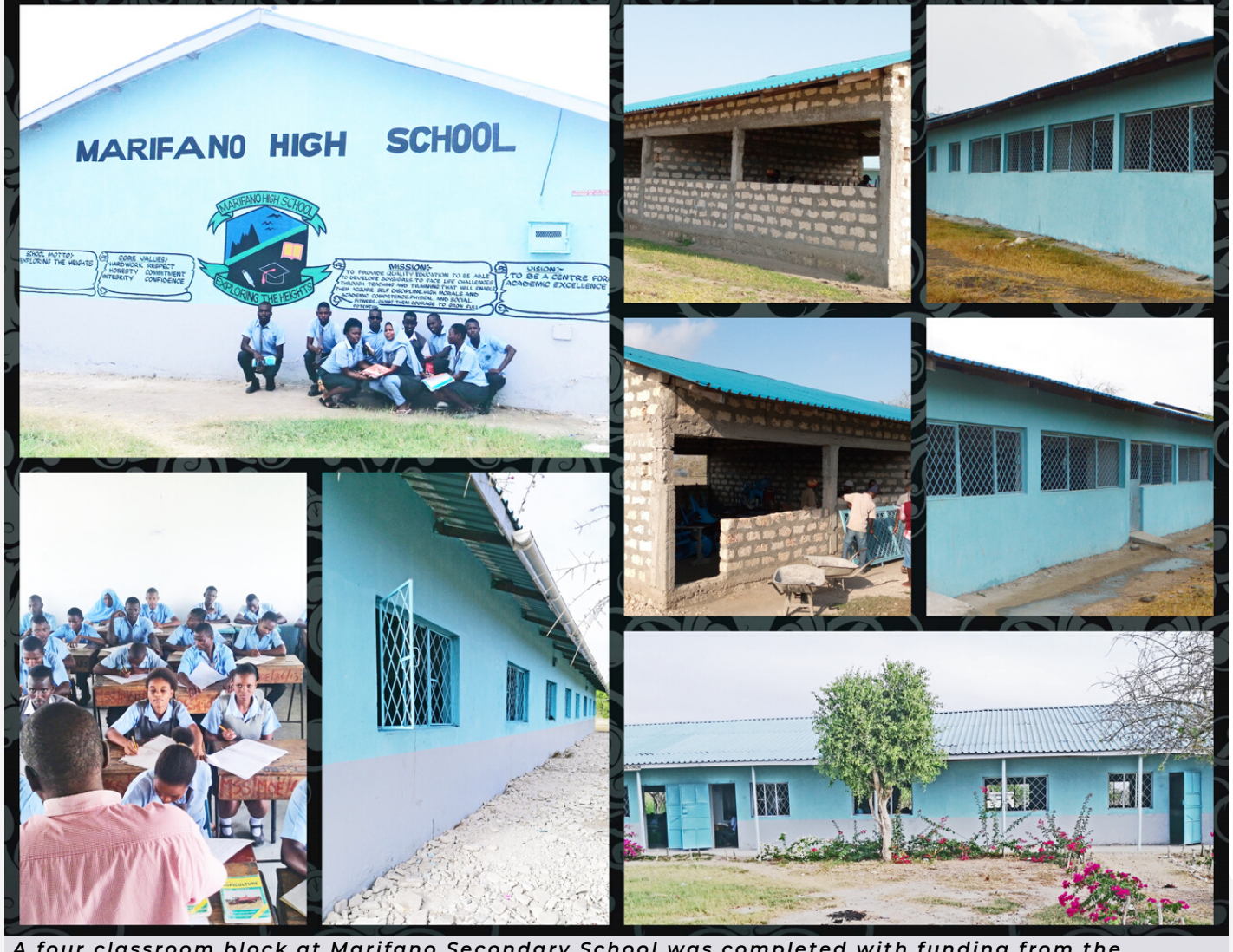
A four classroom block at Marifano Secondary School was completed with funding from the Pavillion Foundation, Singapore.