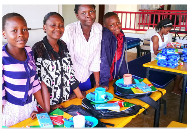
TRLF gives equal educational opportunity to the girl child, who, in poorer rural communities, are often disadvantaged.