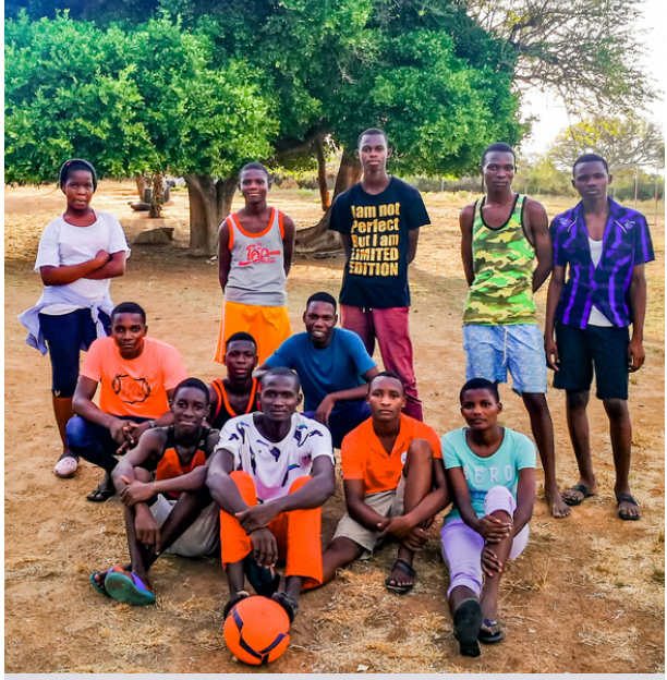
Students on the enhanced programme are nurtured holistically, to help them mature and progress not only academically, but also in their outlooks and depth of living.