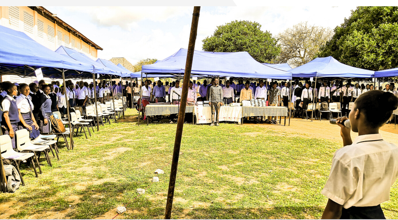
TRLF organized five academic competitions in 2019 bringing together between 400 to 500 examination candidates from all 16 public secondary schools across the Tana Delta.