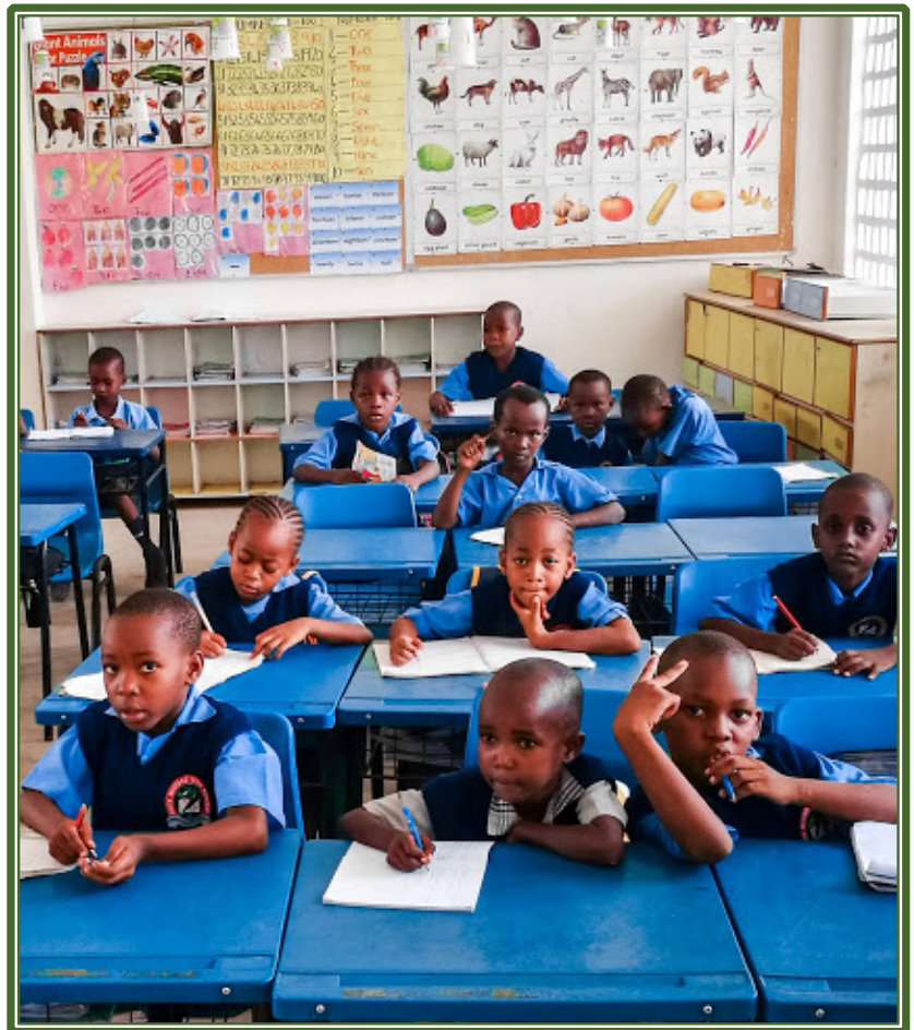
DEMSEA now has 279 students from Pre-Primary 1 to Grade 6 level