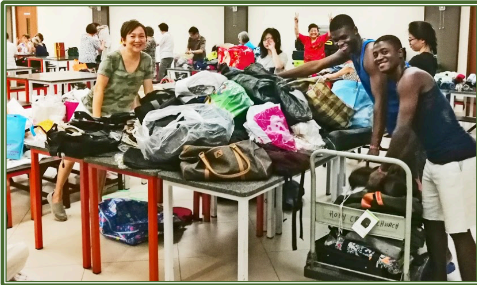
The Golden Disciples of the Catholic Church of Holy Cross helped us once again with sorting and packing used clothes and shoes for the mitumba (recycled goods) project

We are very grateful to the many individual donors from Malaysia and Singapore as well as all the Charitable, Religious, Educational and Corporate entities that have funded TRLF activities over the years. We'd like to give a special mention to Jonaron Foundation , which has sponsored our entire annual administrative budget since 2006.