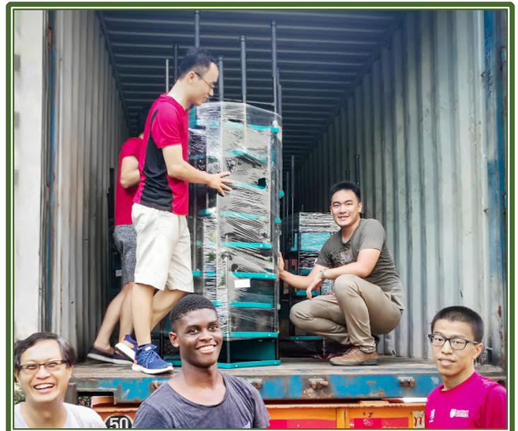
Friends and volunteers help TRLF youth with the loading of furniture and other items for shipment every year

Last but not least, we are grateful for all who have supported us in one way or another in promoting awareness about TRLF and enabling our fund-raising efforts.