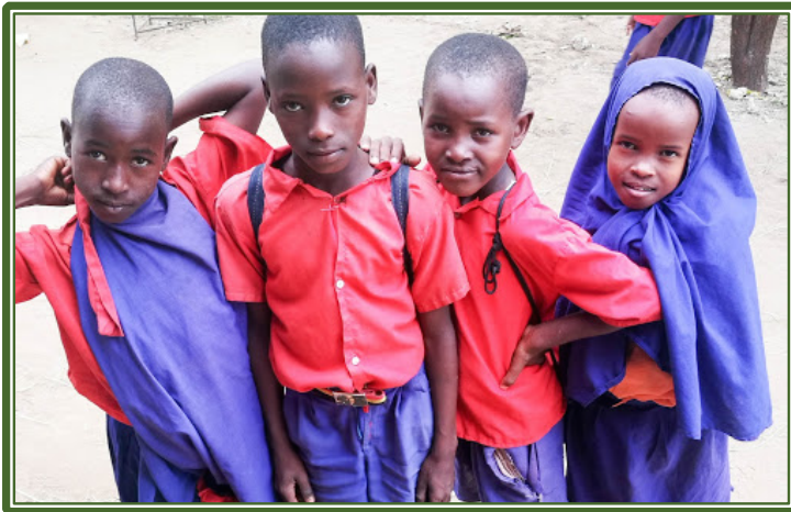
Students from Shirikisho Primary School

TRLF promotes learning of the sciences with greater emphasis on practical or experimental activities