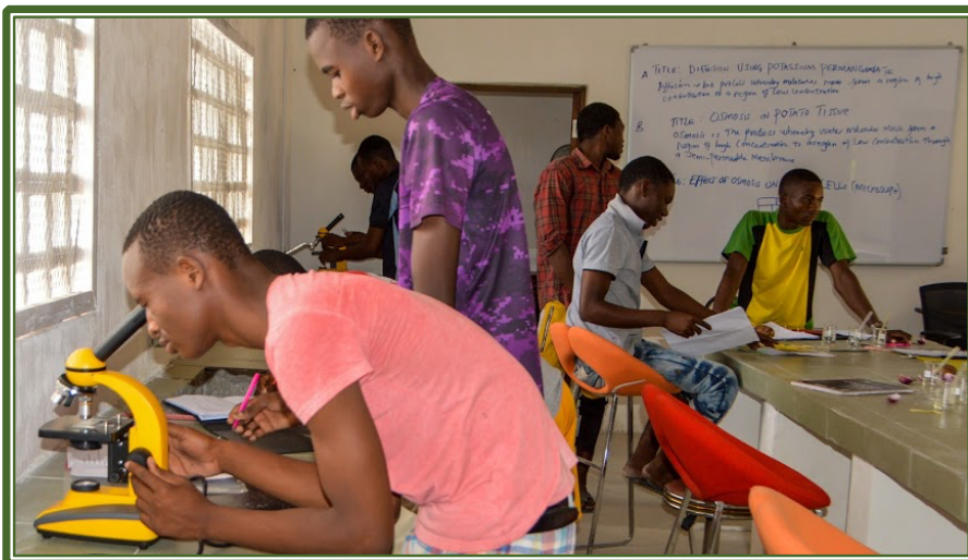
TRLF has been improving the teaching and learning of science in Tana Delta public schools by building science laboratories for rural schools, as well as supplying schools with lab apparatus and consumables. TRLF also constructed a mini lab at the Emmaus Community Centre for remedial teaching