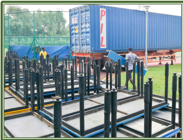
PIL Singapore and Logwin Air + Ocean Pte Ltd have been kindly underwriting all shipment and clearance costs for the past four years

Our deepest appreciation as well to all for the generous donations in kind of used items for resale (i.e. clothes, shoes and bags), used school furniture and many other useful items for distribution to the public schools in Tana Delta.